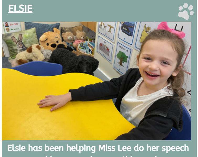
and language lessons this week.